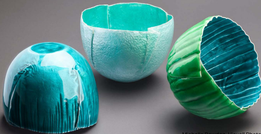
Michelle Bowden, Visual Photography