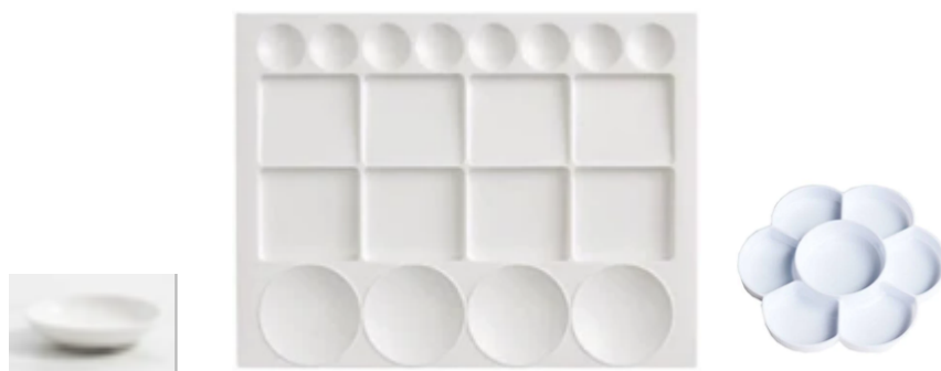
Small condiment dishes (white)

Palettes: 1 x large palette or several smaller ones. This can be purchased from an art shop or you can use white ice-cream container lids, or white plastic trays or plates. See images below.